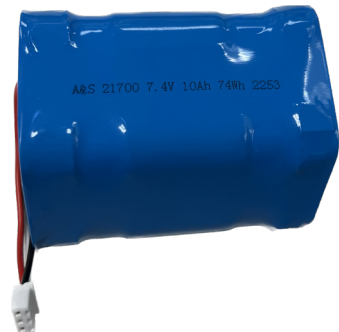
Figure 2. Battery

When battery icon is red, it needs to be charged. Use only the power supply that was received with the system. Plug the power cord into the front of the system (See " Figure 2. Battery ") and charge for 6 to 8 hours.