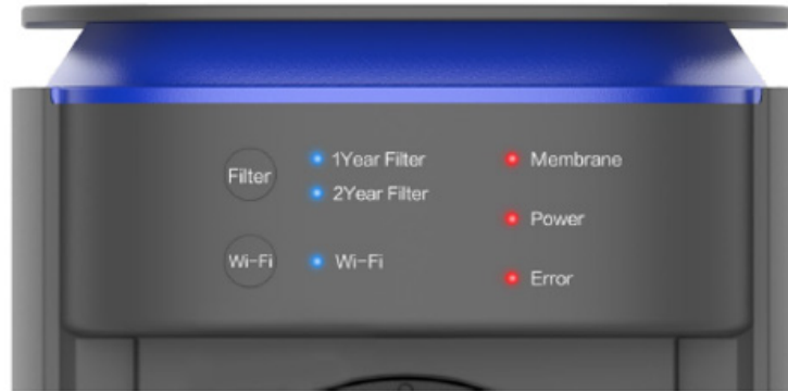
Figure 1. Smart RO unit LED indicators