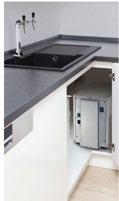
BluSoda Box installed in cabinet.

Innovative direct cooling technology means a compact, space-saving design that chills water quicker and more efficiently than the standard cooling process.